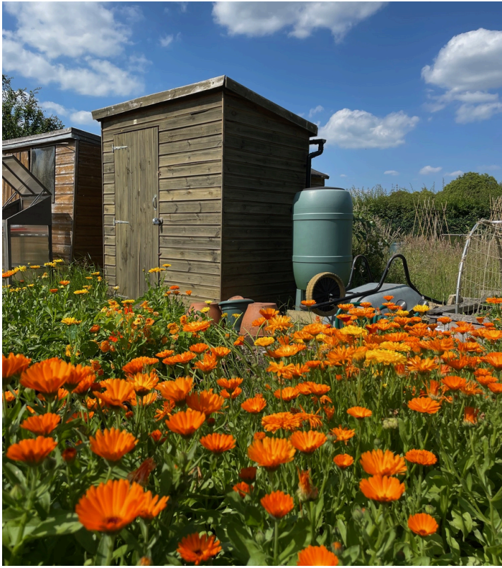
THE HILL | Kings Hill Parish Council