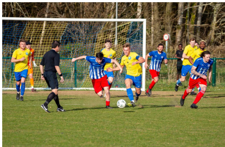
Kings Hill FC vs. Aylesford FC

Our youth squads return to training at the end of August, with their league seasons kicking off in September. It has been a busy summer for our Club Secretary,